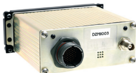
DZM2 rear view showing the environmentally sealed enclosure (IP54).