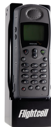
Left: The Flightcell Iridium Phone Mount.